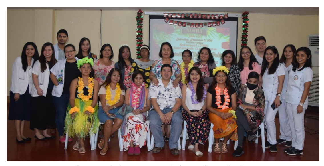
FROM REGION 1 LUPUS SUPPORT GROUP, MERRY CHRISTMAS!!!