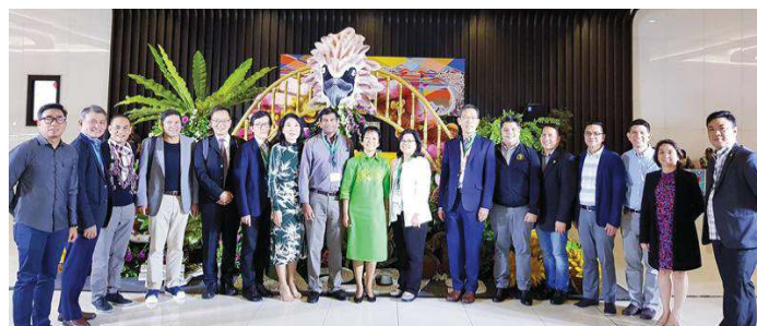
PRA Board of Trustees with International Speakers

The 2-day scientific activity centered on holistic and integrated approach in the field of Rheumatology with primary aim of better understanding of the complexities of autoimmune and auto-inflammatory disorders. Very interesting and novel topics delivered by top-notch local and international faculty kept the audience, composed of rheumatologists, trainees, and medical students, actively engaged up to the last lecture.