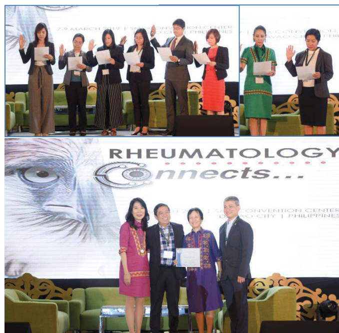
Top: UST Rheumatology graduates inducted as PRA fellows and diplomates