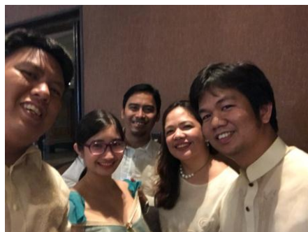
USTH Fellows at the

From 15 th to 17 th of February 2018, Crowne Plaza Manila Galleria was the setting for the Philippine Rheumatology Association's 24 th Annual Scientific Meeting. The first day's pre-convention offered two tracks, a Rheumatology Workshop for Nurses and Rheumatology for Non-Rheumatology Clinicians.