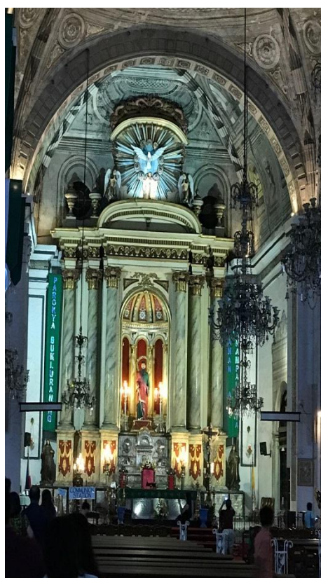
Saturday anticipated mass at the San Agustin Church