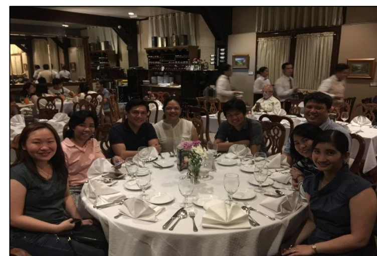
UST Rheumatology Fellows