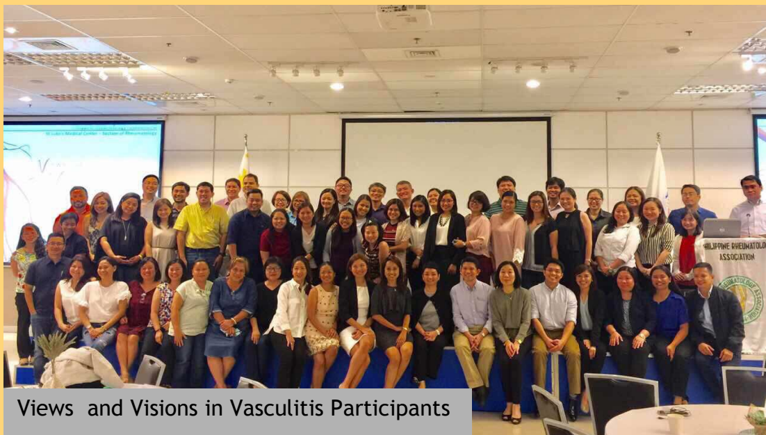
Views and Visions in Vasculitis Participants